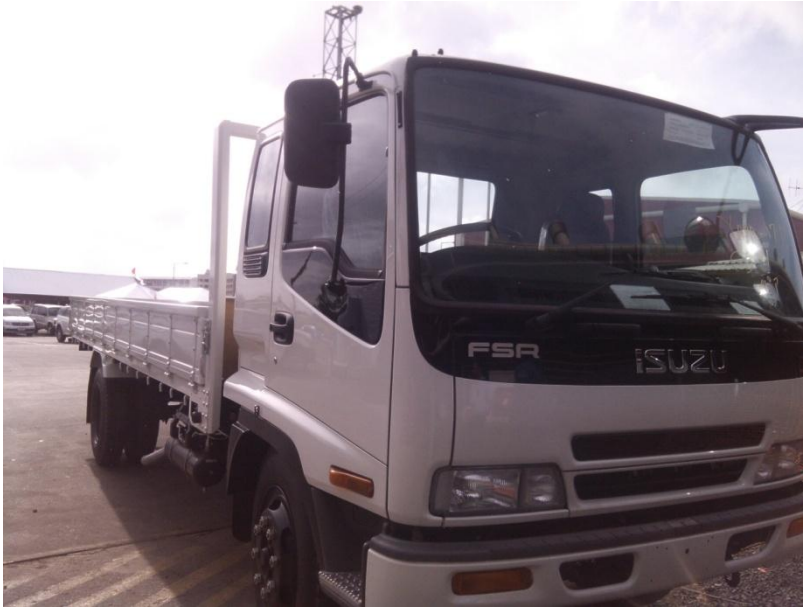
Pictured: The largest of the three new trucks obtained by the Samoa Law and Justice Sector for use by the Ministry of Police and Prisons.

Access to vehicles is important for the day-to-day transportation needs of the three corrections services. The safe and secure transportation of offenders is part of ensuring that Samoa's prison services operate efficiently and effectively. As the Sector works on a long-term project to separate prisons administration from police administration, this project addresses the need to ensure that corrections services are well equipped.