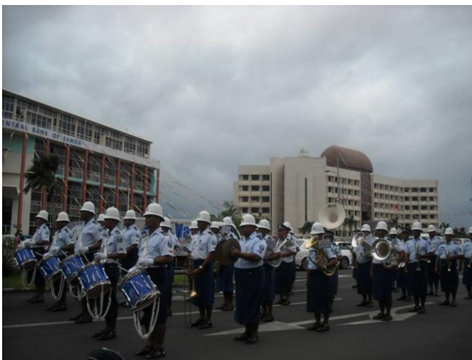
Pictured, from left: Samoa Police Band passing the Flame Mata'afa Faumuina Mulinu'u II Government Building decorated for Independence Day; officers in formation at the Independence Day march on 1 June.

The Police Band from the Ministry of Police and Prisons featured in Samoa's Independence Day celebrations this year, leading the flag-raising at the commencement of the official ceremony and executing an impressive march in the afternoon presentation. The Sector was also represented in the march by the Ministry of Justice and Courts Administration.