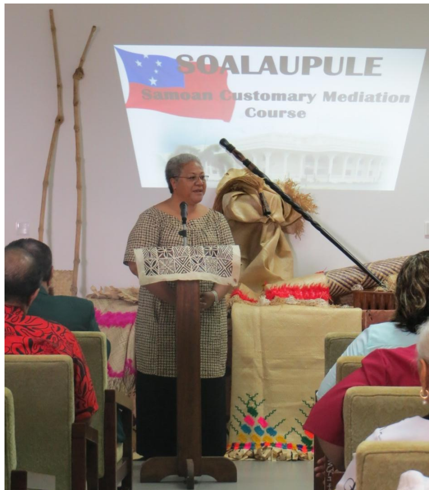
Pictured: The Honourable Fiaame Naomi Mataafa, Minister of Justice and Courts Administration, delivers the keynote address at the launch of the Soalaupule Samoan Customary Mediation Course on 11 July 2013.

Under the Land and Titles Act 1981, Samoan mediation (soalaupule) of all matters involving customary land and matai titles is mandatory before filing any application for a court order.