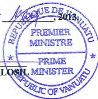
Honourable MOANA CARCASSES KALOSIL Prime Minister

Made at Port Vila this 31 st day of May , 2013.