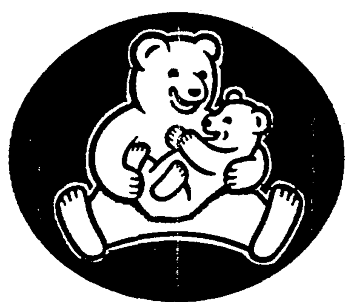
"Bärenmarke" - Marque "a l'Ours" - "Bear Brand" Marca "Oso" - Marca "Urso" - Marca "Orso"

The Mark is shown below with the omitted portion included.