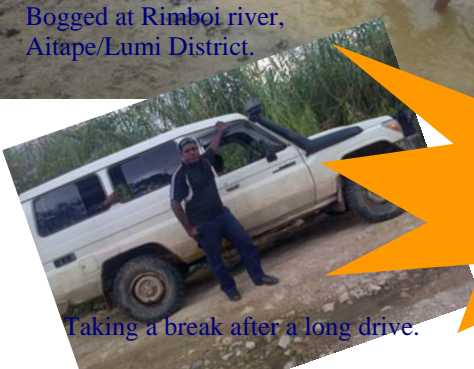
Taking a break after a long drive.