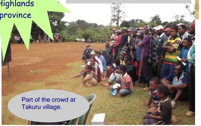
Part of the crowd at Takuru village.