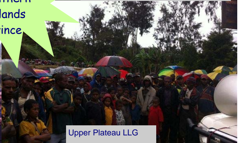
Upper Plateau LLG