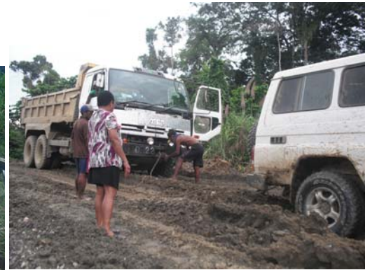
Stuck along the way at Bewani, West Sepik province.

Ombudsman Commission of Papua New Guinea, Ground Floor, Deloitte Tower, Douglas Street, PO Box 1831, Port Moresby 121, NCD, PAPUA NEW GUINEA, Phone: 675-308-2600 Fax: 675-320-3260, Email: ombudspng@ombudsman.gov.pg