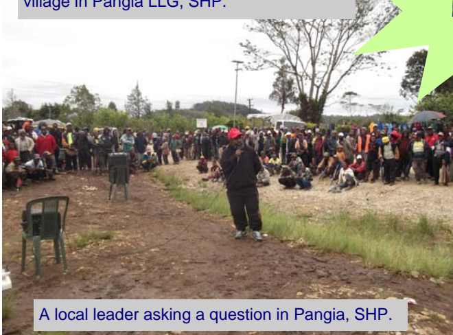
A local leader asking a question in Pangia, SHP.

LLG awareness in Southern Highlands province