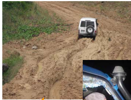
The bad road condition at Bewani, West Sepik province.