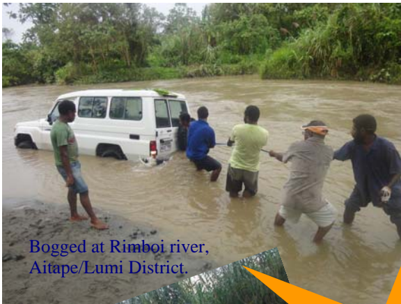
Bogged at Rimboi river, Aitape/Lumi District.