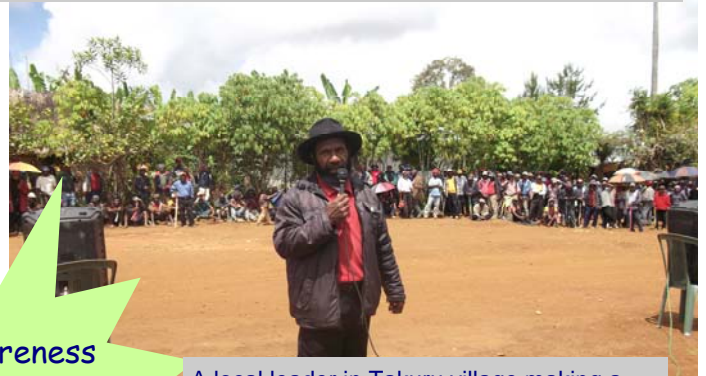
A local leader in Takuru village making a comment.

LLG awareness in Southern Highlands province