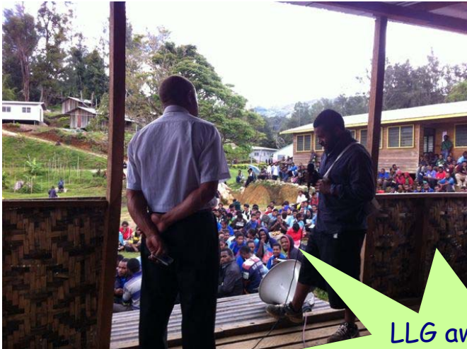
A student of Nipa Secondary School asking a question.