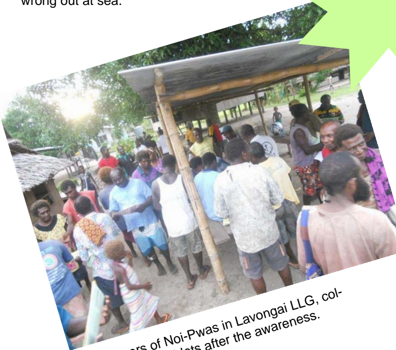
Villagers of Noi-Pwas in Lavongai LLG, collecting pamphlets after the awareness.