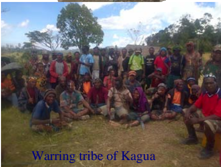
Warring tribe of Kagua