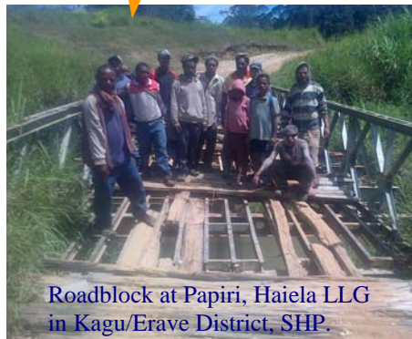
Roadblock at Papiri, Haiela LLG in Kagu/Erave District, SHP.