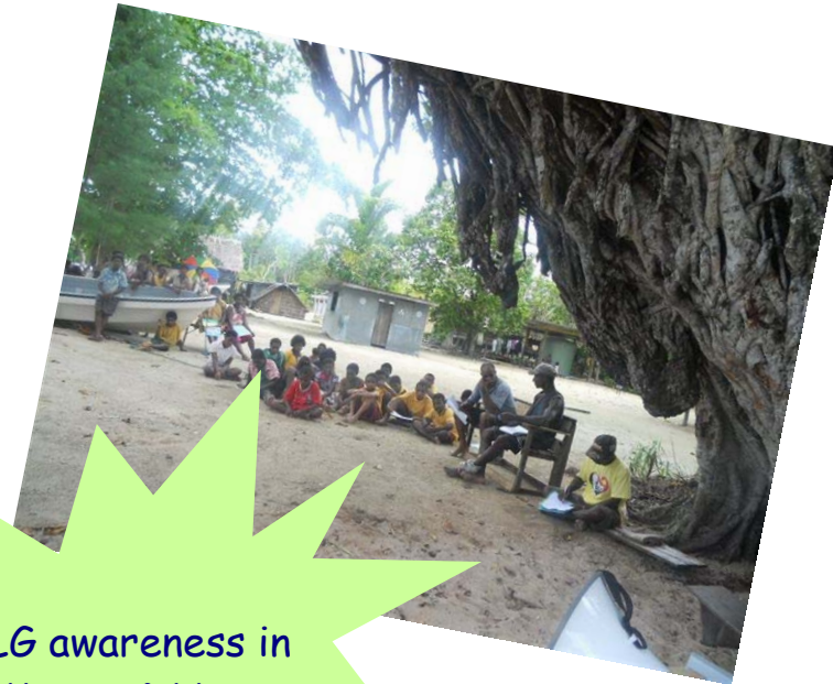
LLG awareness in Manus & New Ireland provinces