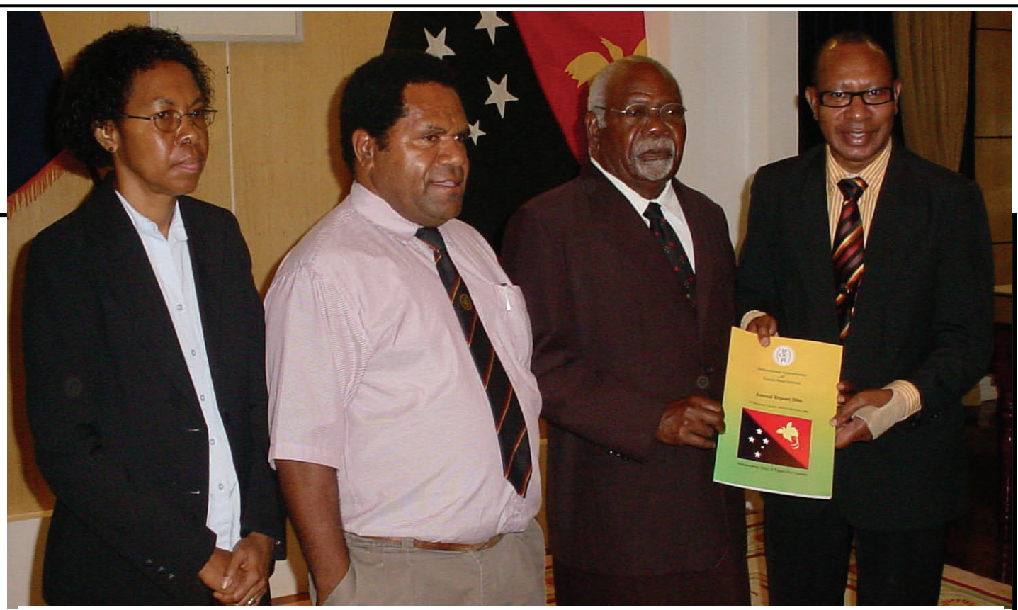
Members of the Commission pose with the Governor-General Grand Chief Sir Paulius Matane during the presentation of the OC 2006 Annual Report at Government House in March.

The submission, was made in light of the amendments to provisions of the Leadership Code advertised in the National Gazette No G192 dated 22 October 2008. The Ombudsman Commission has considered it necessary for the purpose of making its position and also for the purpose of raising awareness on apparent misunderstanding of the role and function of the Commission to prepare the submission to assist the legislators.