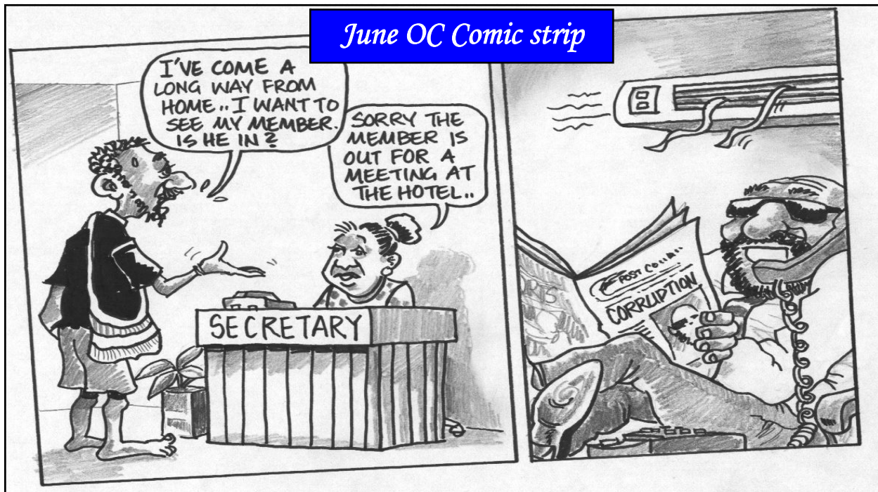
June OC Comic strip

They left for Australia on Sunday 28 June, 2009.