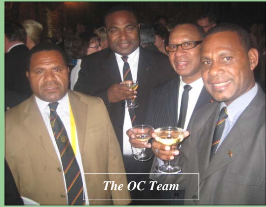
The OC Team